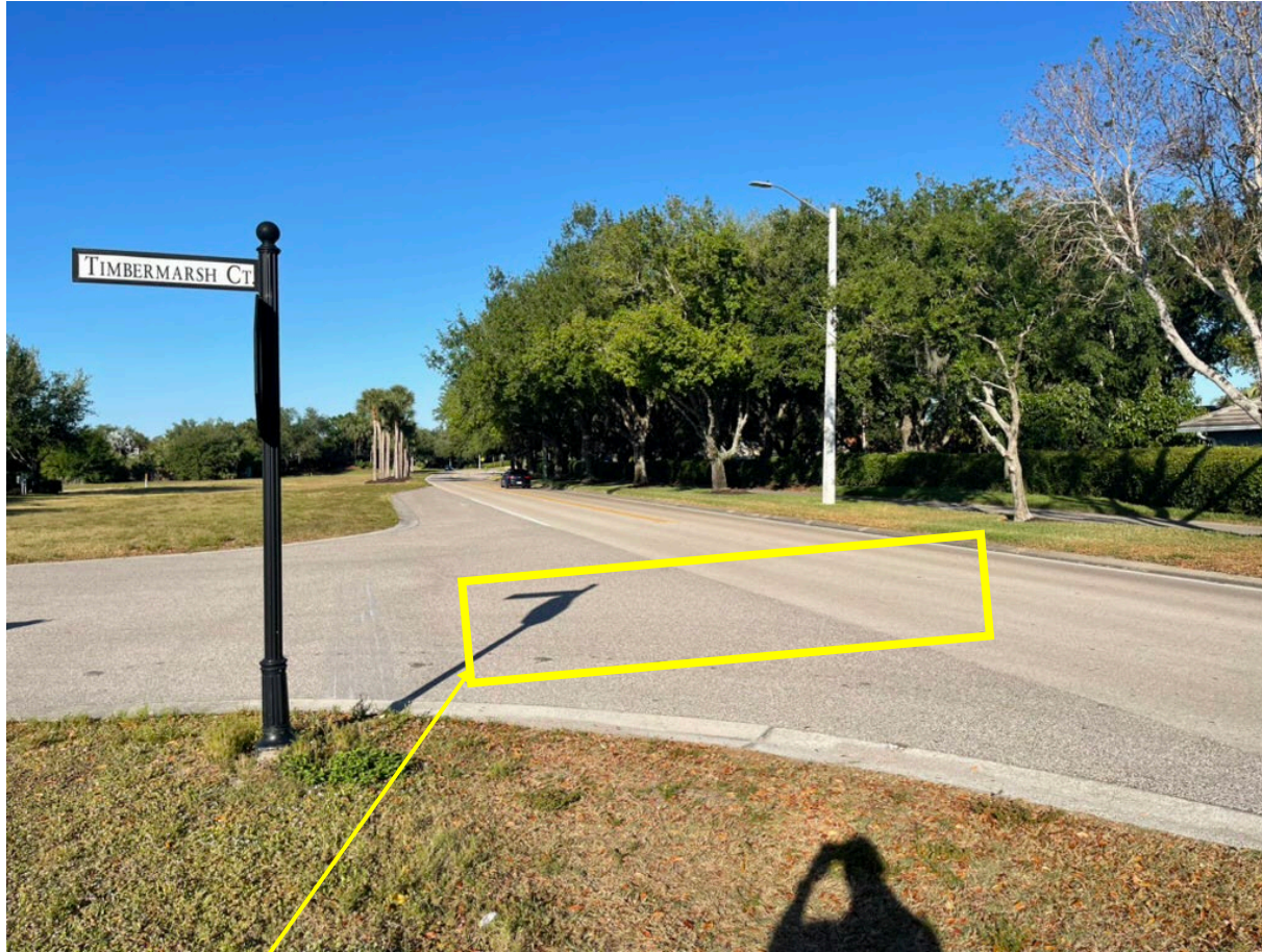
Fig 1. Facing West from Timbermarsh ct.