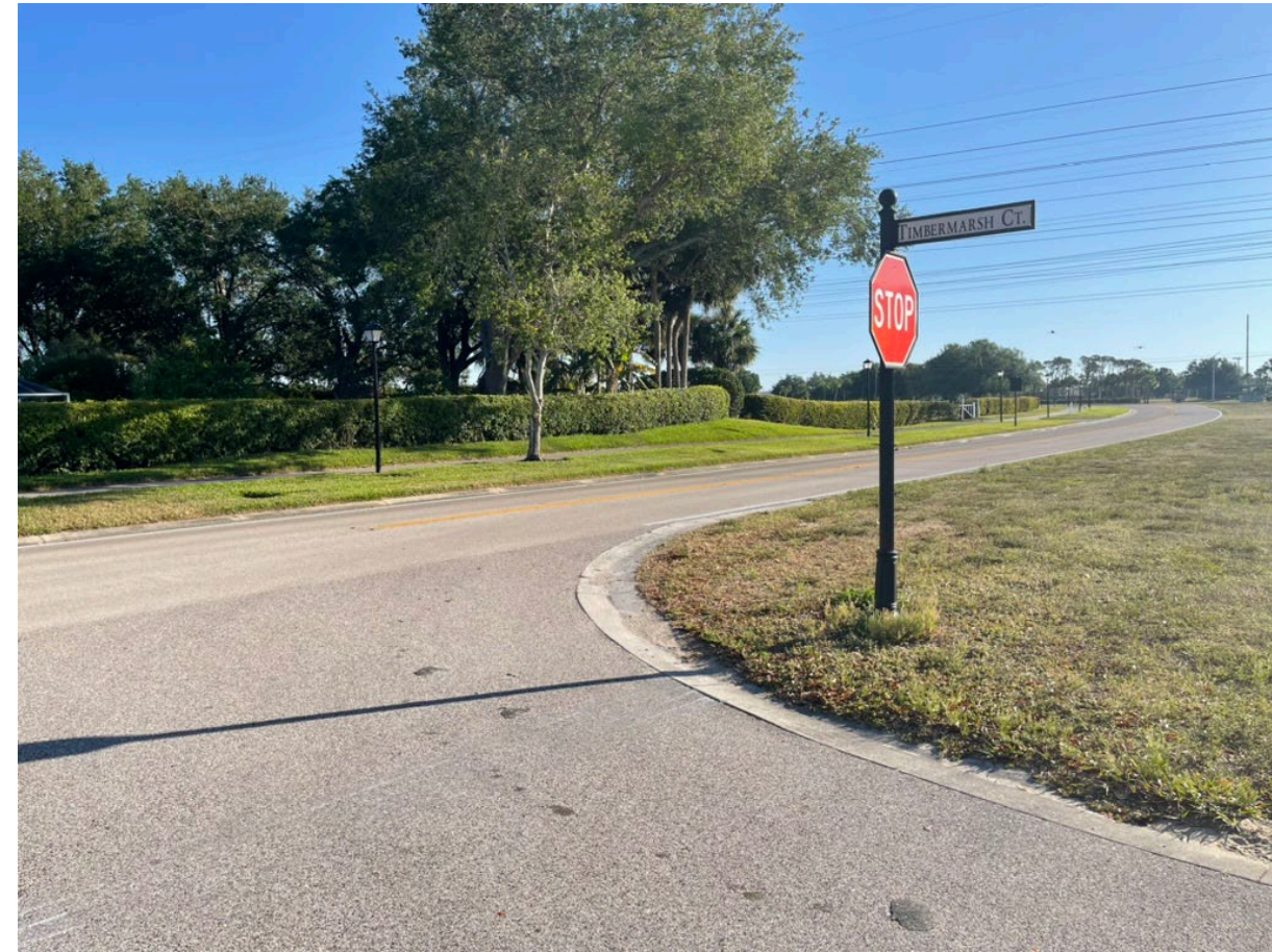
Fig 2. Facing East from Timbermarsh ct.