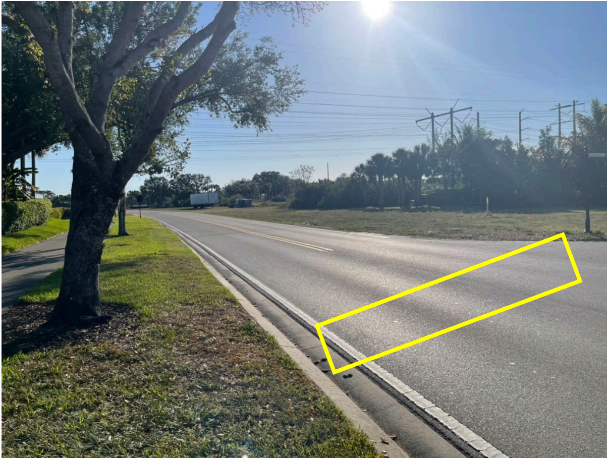
Fig 3. Facing East from opposite side of Timbermarsh ct.