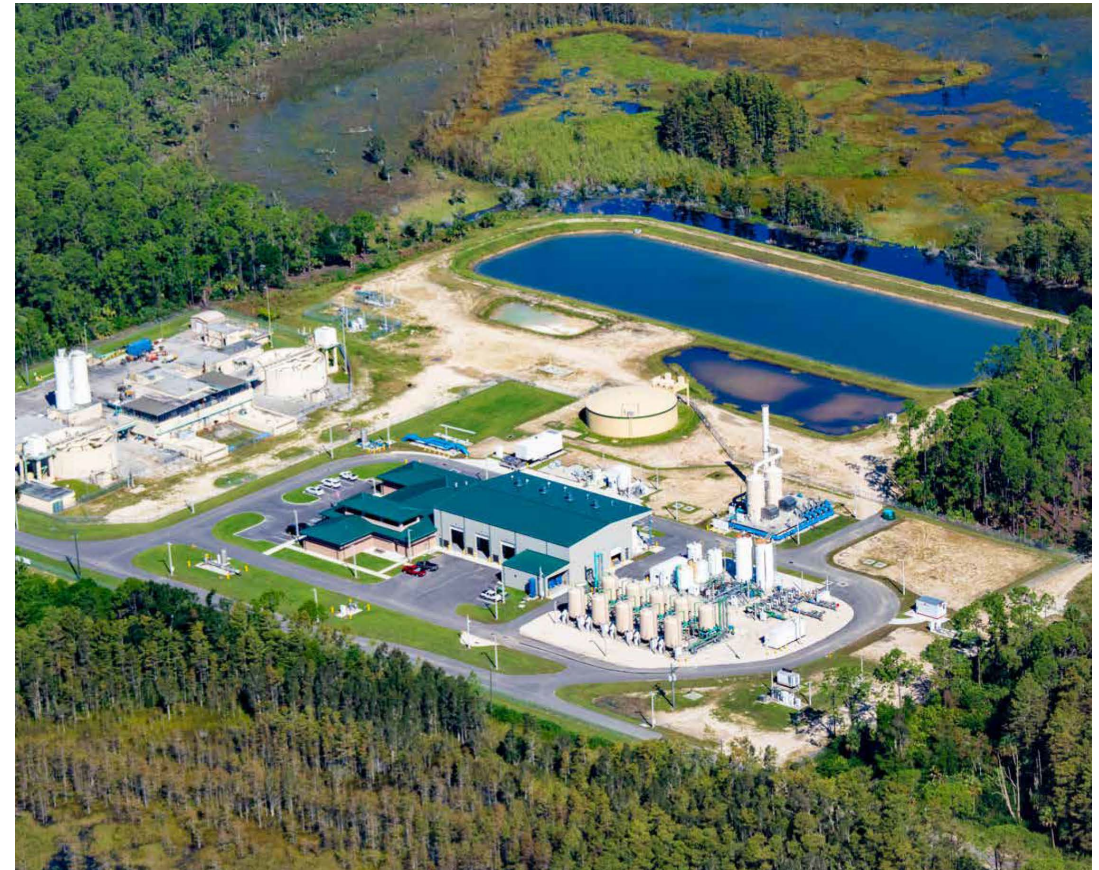
Green Meadows WTP

Policy 54.1.15 Consider the use of desalinated seawater.