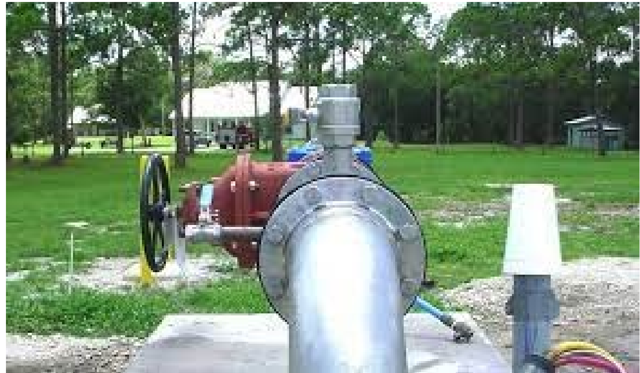
North Lee County RO Water Treatment Plant Expansion

Ten Year Water Supply Development Projects