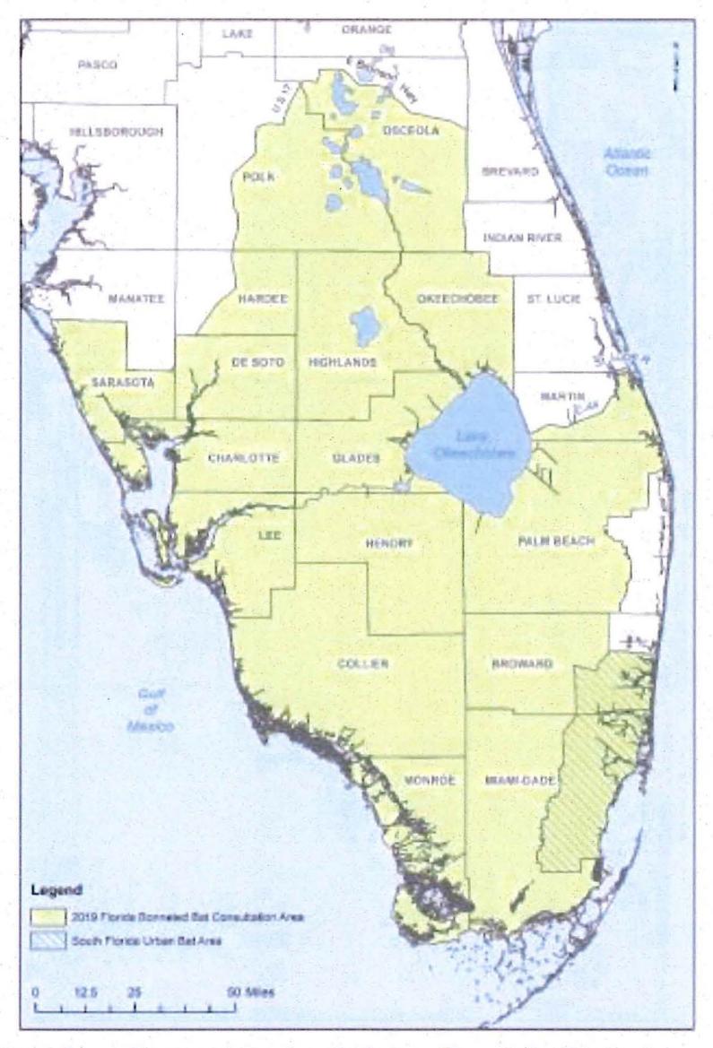
Figure 1. Florida Bonneted Bat Consultation Area. Hatched area (Figure 2) identifies the urban development boundary in Miami-Dade and Broward County. Applicants with projects in this area should contact the Service for specific guidance addressing this area and individual consultation. The Consultation Key should not be used for projects in this area.

2017 states "[w]idely scattered pine tree snags with potential bonneted bat cavities were observed." The United States Fish and Wildlife Service provided the included Figure 1 showing the consultation area in 2019.^{3}