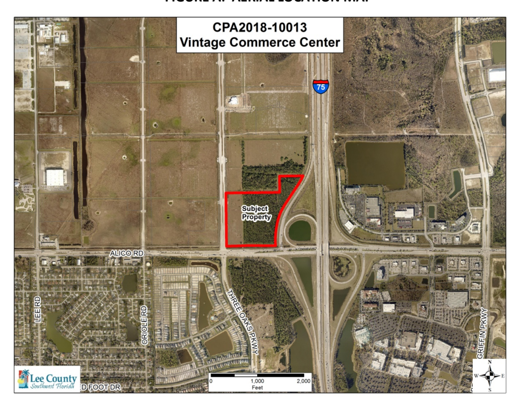
FIGURE A: AERIAL LOCATION MAP

The subject property is located on the northeast corner of Alico Road and Three Oaks Parkway, and is immediately west of I-75.