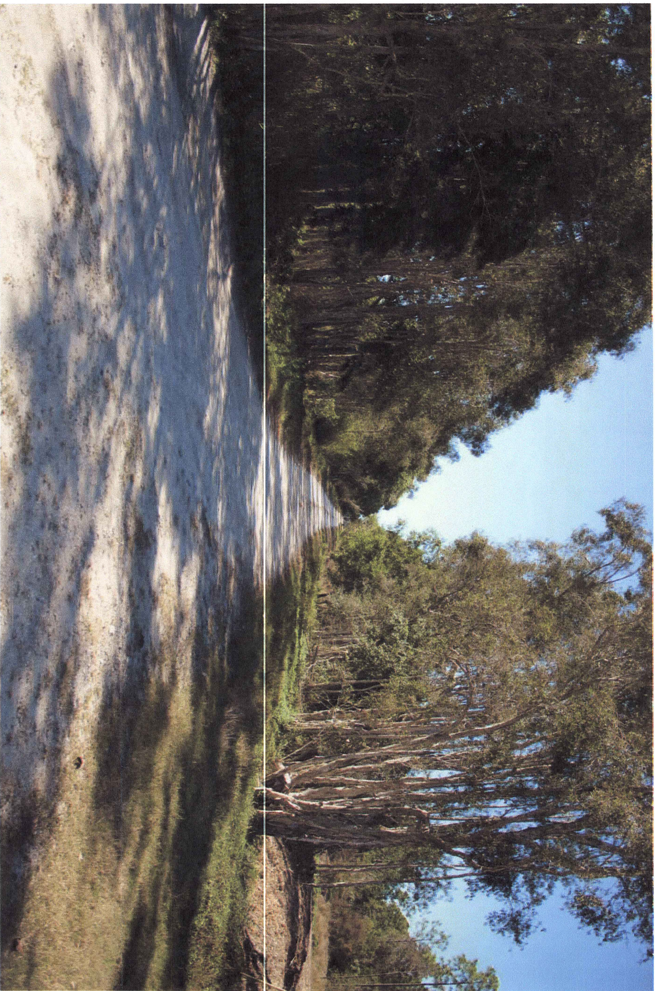
Snell Lane: Looking West from end of improved road