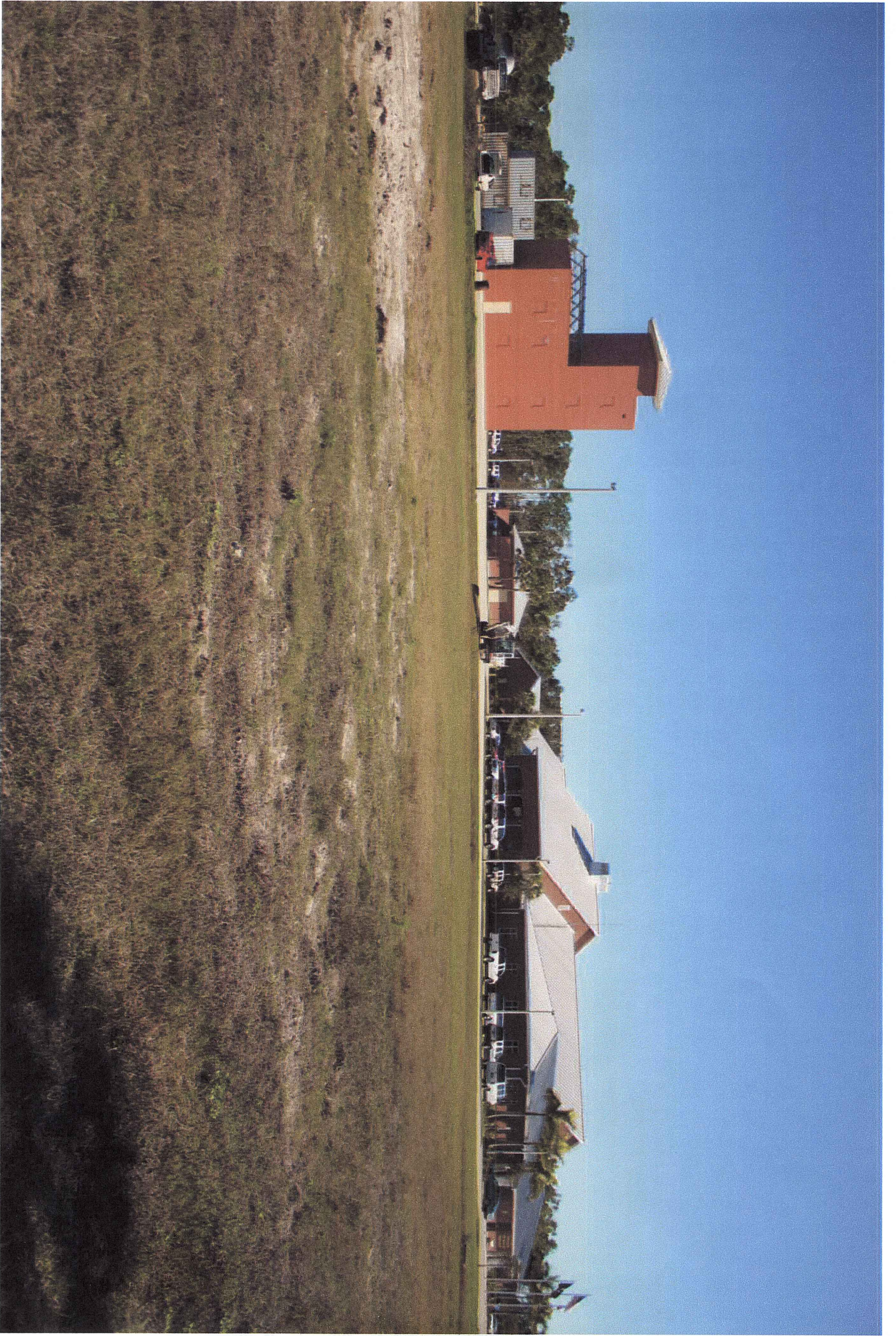
Fire Station #4: Looking Southeast from within property line near Bonita Grande Drive