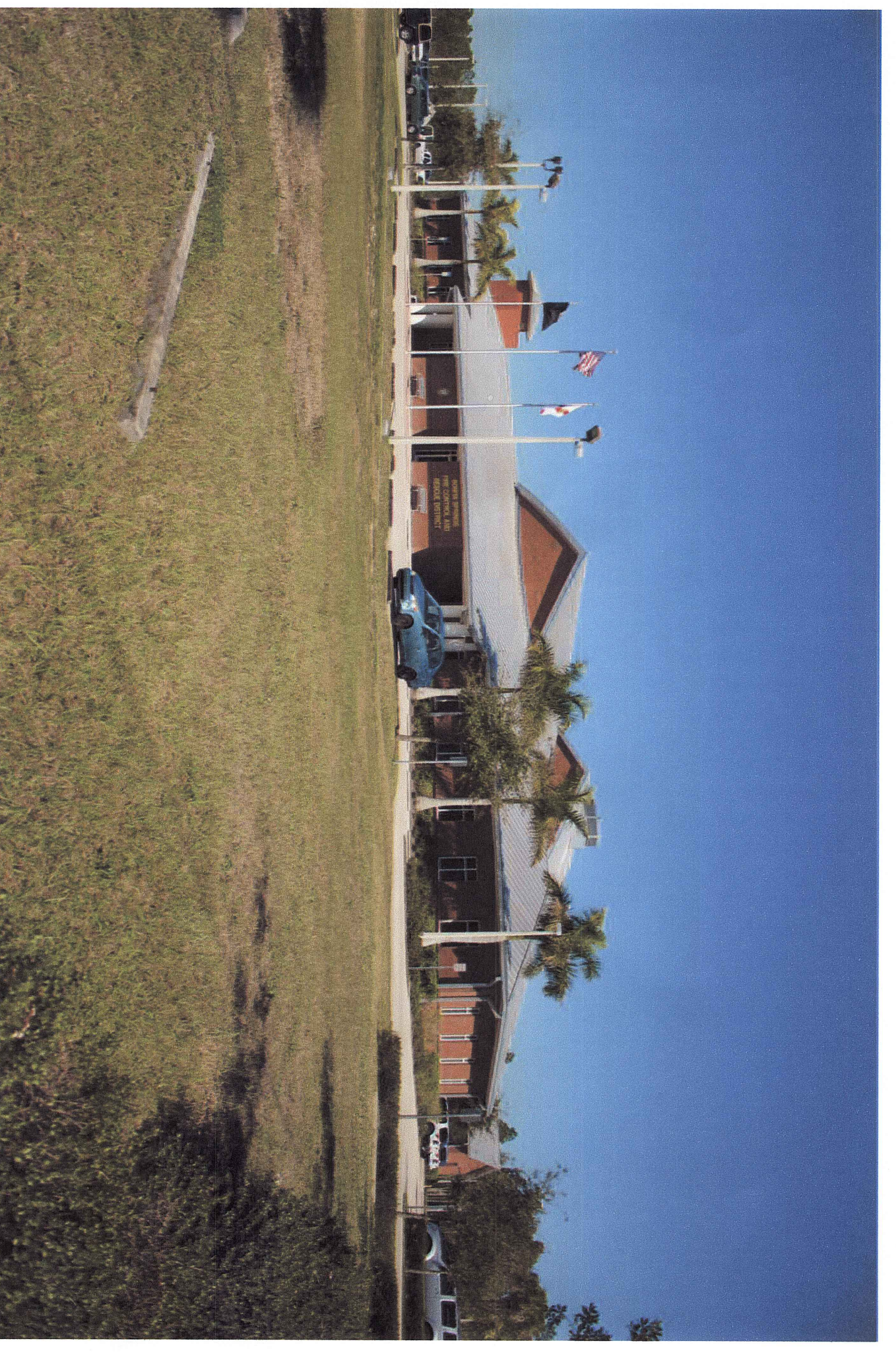
Fire Station #4: Looking Northeast from Snell Lane