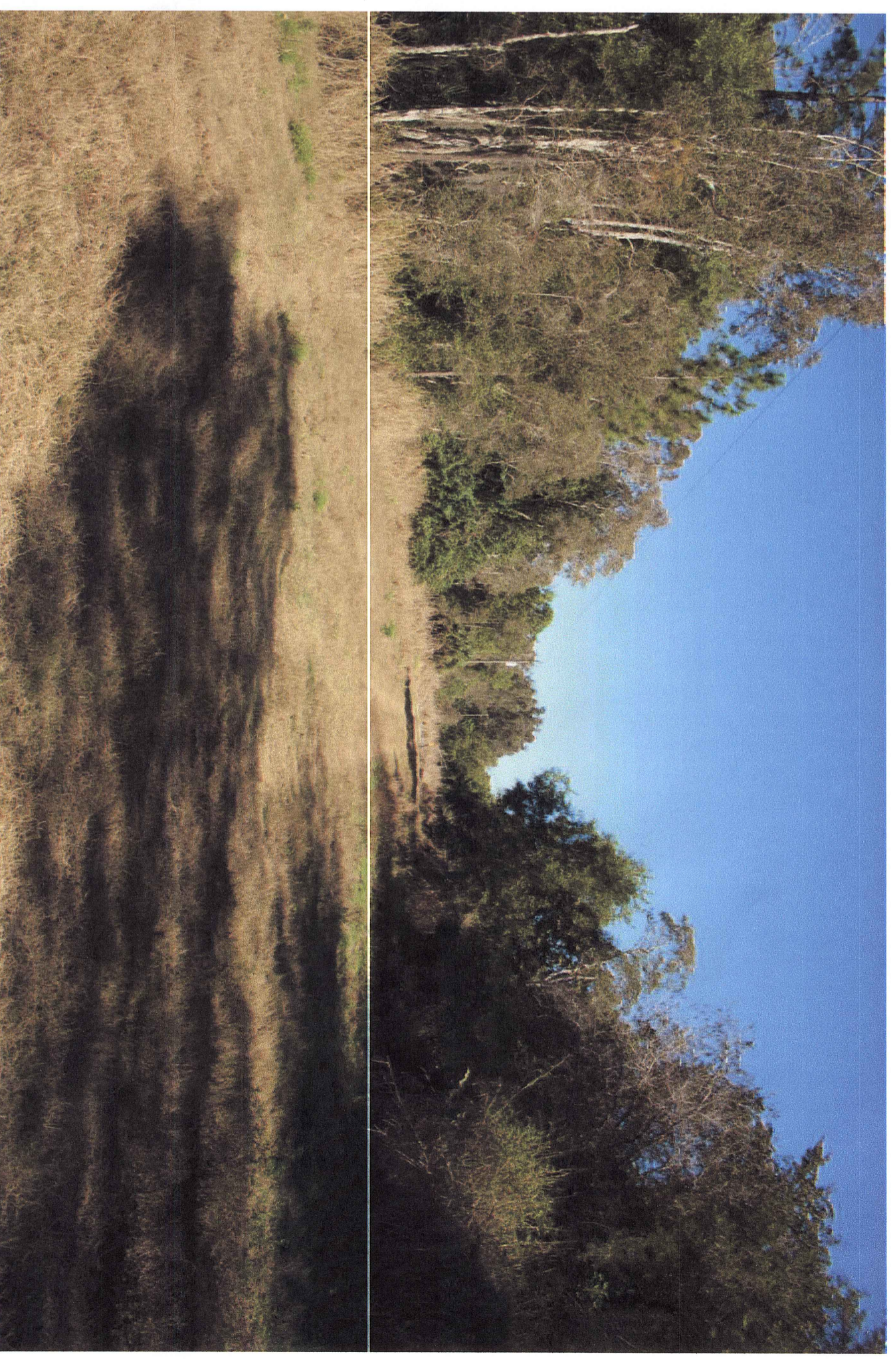
Snell Lane: Looking West from end of improved road. Subject Property begins at Power Pole with white transformer