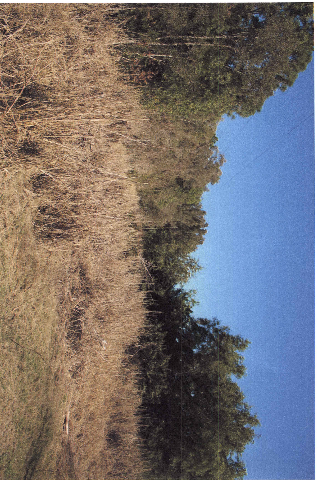
East: Looking East along Snell Lane to vacant property. Subject Property is located on left of picture and ends at Power Pole.