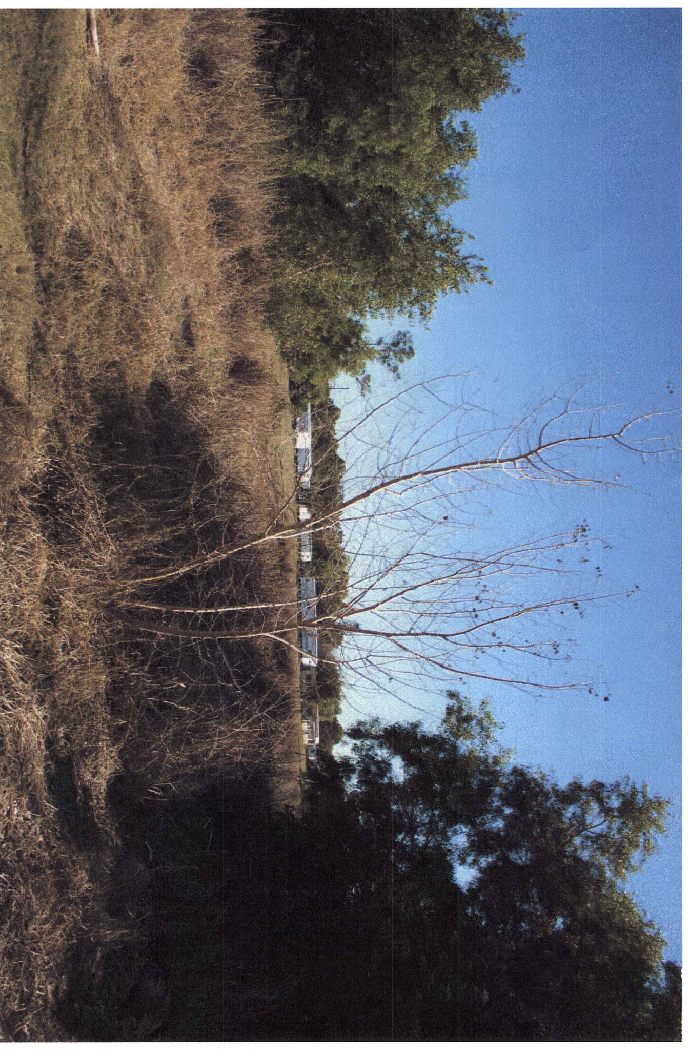
Southeast: Looking Southeast from SW Property Corner toward mobile home park.