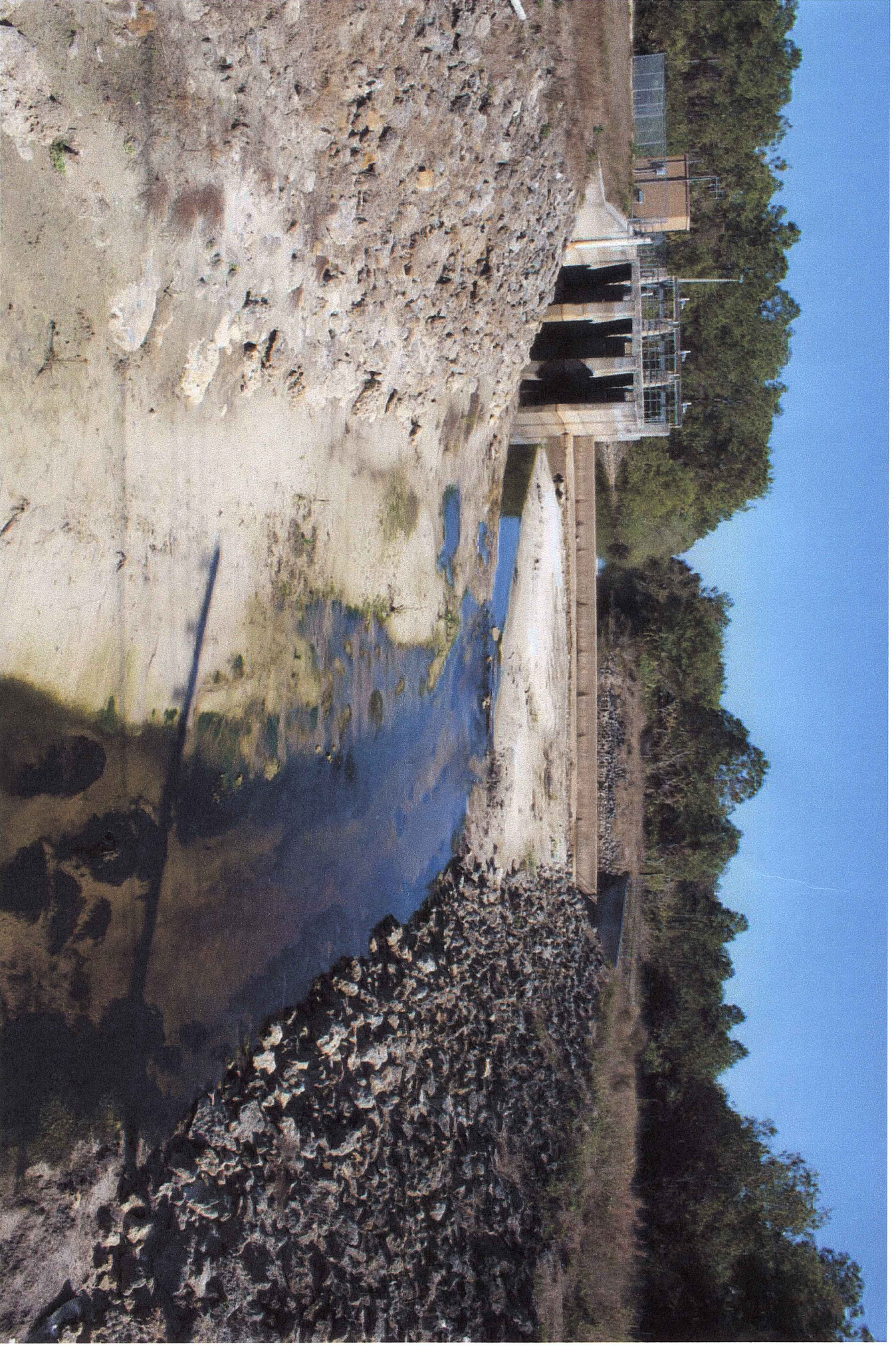
Kehl Canal Weir: Looking East from Bonita Grande Drive