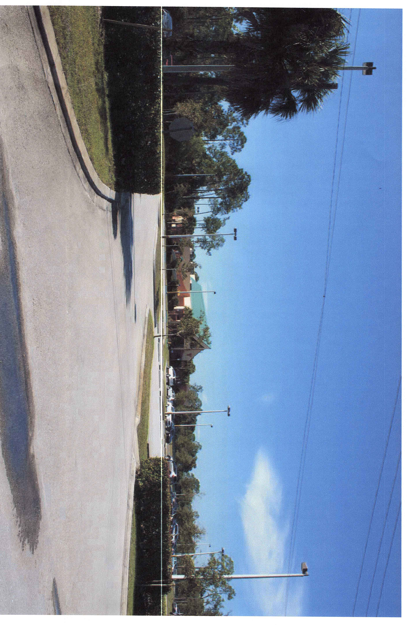
YMCA Property: Looking West-Northwest from Kent Road