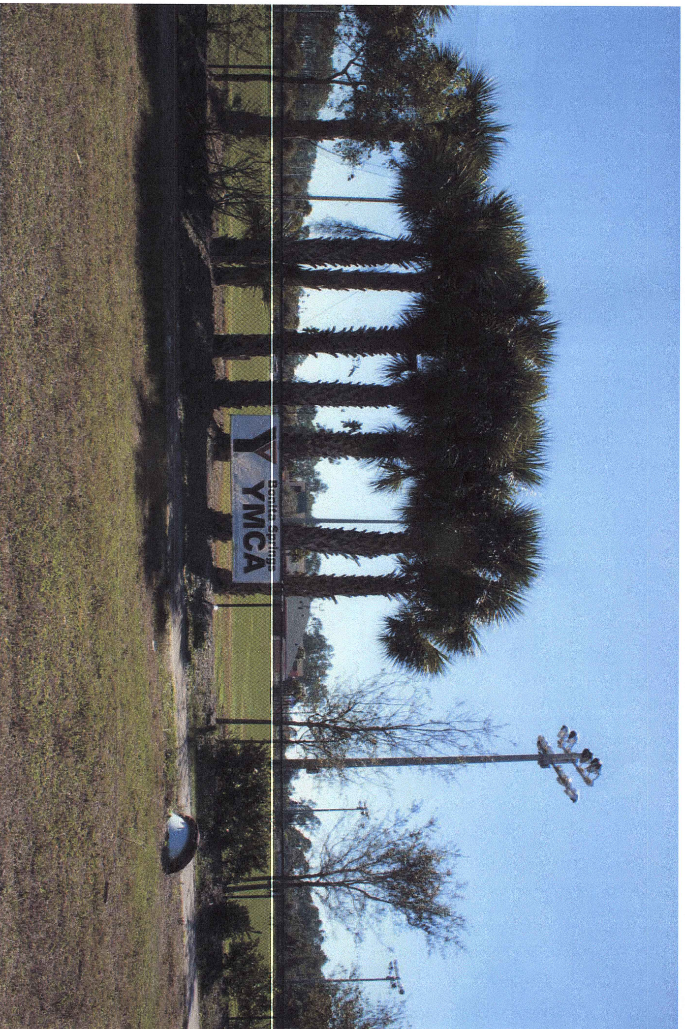
YMCA Property: Looking South from E. Terry Street