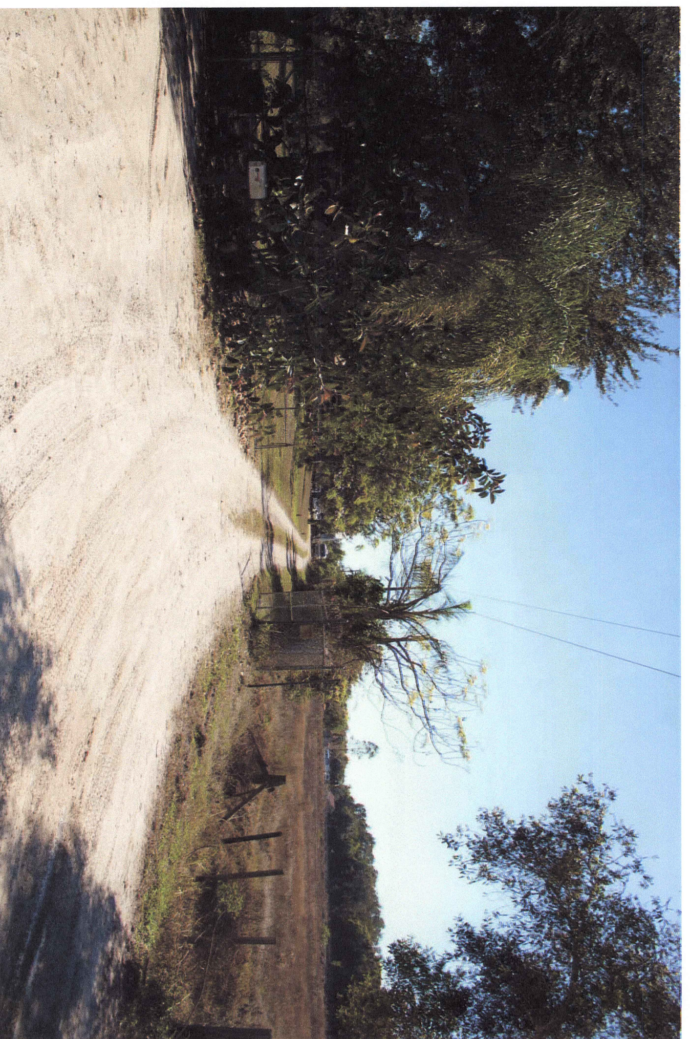
Existing Single-Family Dwelling to Southwest of Property: Looking South down driveway from Snell Lane.