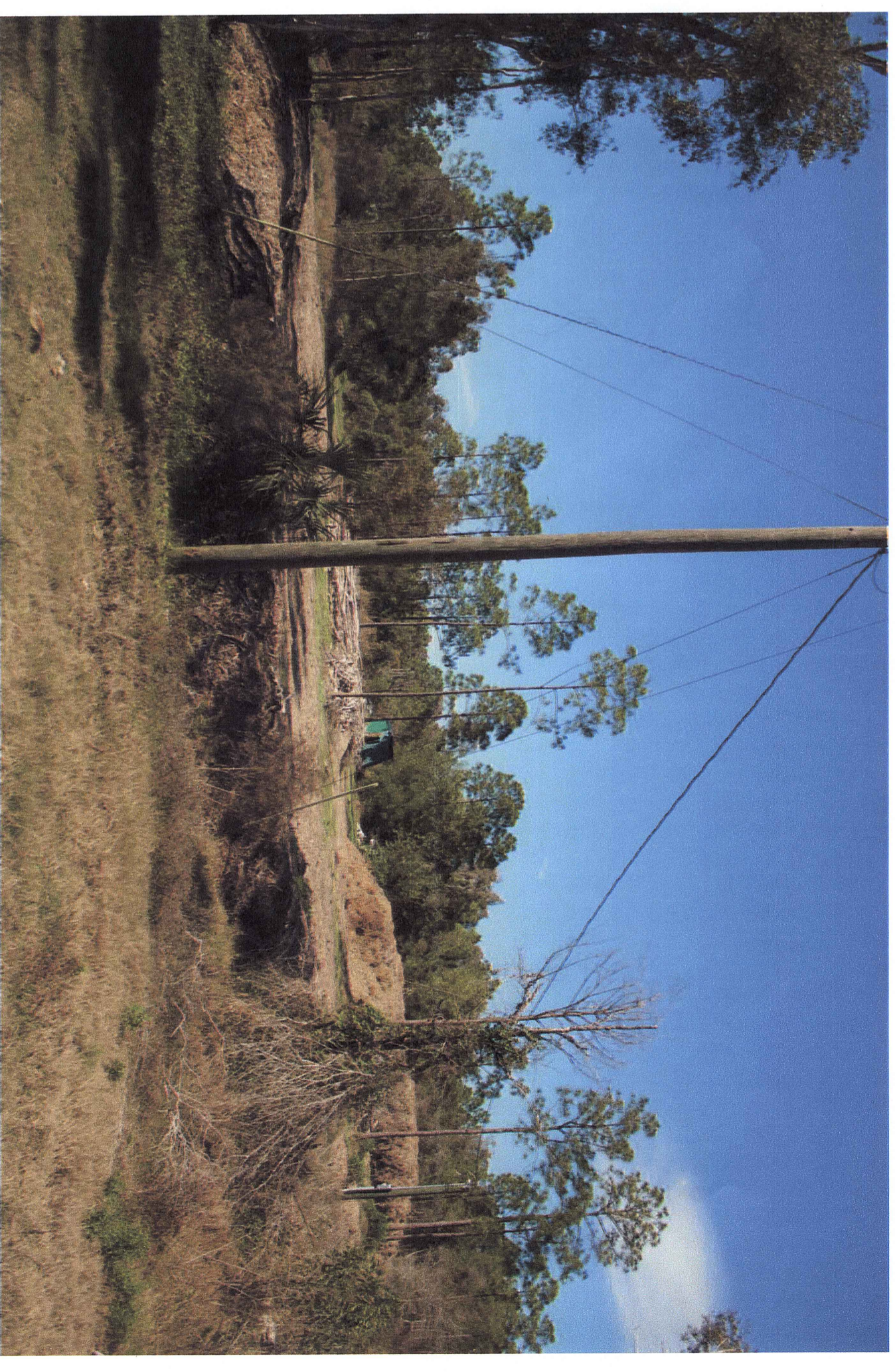
Existing Nursery to West of Property: Looking Northwest from SW Property Corner on Snell Lane.